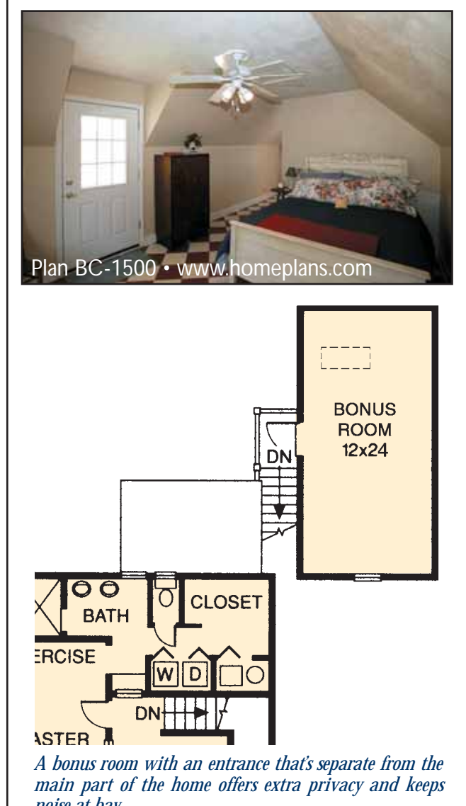
noise at bay.

Go to www.homeplans.com/rdr/bonus to view more homes with extra rooms.